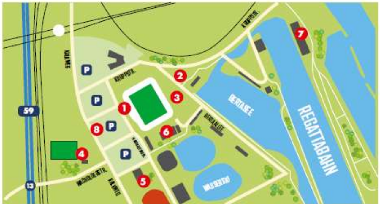
Lage der Wettkampfstätte/Map of the competition site/Plan des lieux de compétition